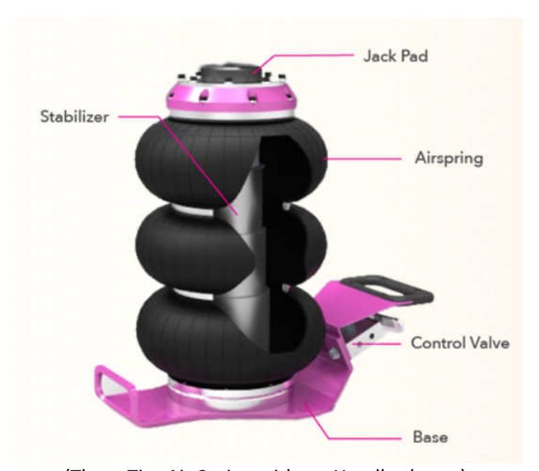
(Three Tier Air Spring without Handle shown)

Depending on the Bag Jack model, the EZ Air Bag Jack is designed to have one to three tiers with or without extension Handle. In special cases, large-sized pneumatic bags can be employed to fulfill the task at hand, if for example the vehicle that is to be lifted is very heavy.