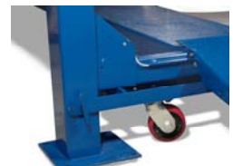
Optional Drip Trays